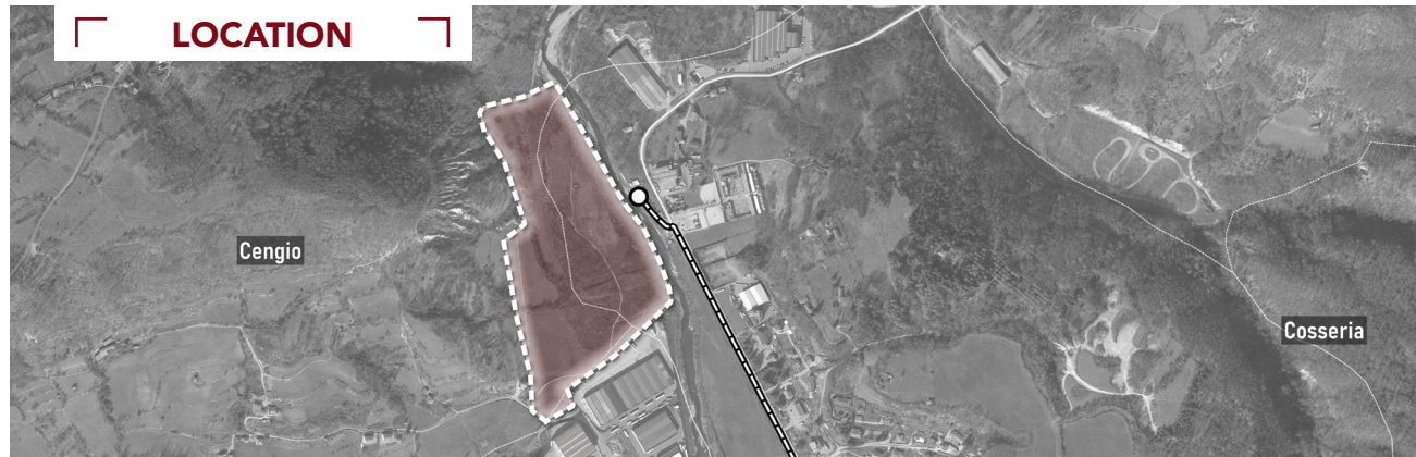
Cengio (SV) Via G. Mameli, Area "Valzemola" (greenfield)

Area of approx. 123 thousand square meters, located in the municipality of Cengio, on the border with Millesimo, 1.2 km from the highway exit (km 29 of the A6, Savona Turin) reachable in 3 min. (heavy traffic). The PRG places it in zone D8 with productive, commercial and transport service destination. Implementation by means of an agreed construction permit. The project also plans to intervene on approx. 13,500 sqm of agricultural use. The catchment area at 60 min. (evaluated within a basin calculated with heavy traffic) is 330,000 inhabitants.