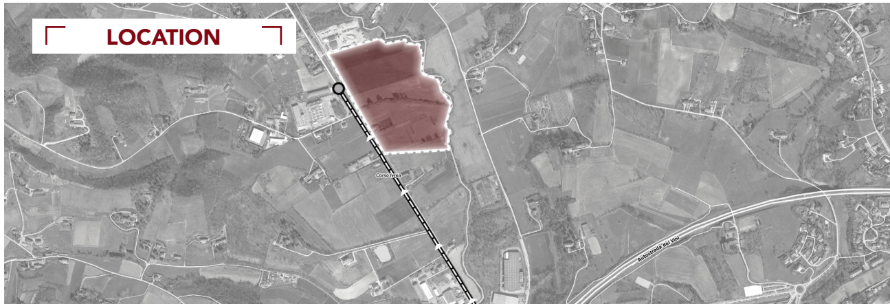
Asti (AT), SP 458, Area "Rilate" (greenfield)

148.000 sqm area on the SP458 (Corso Ivrea), situated very favourably in relation to the A21 motorway Torino-Piacenza, less than 3 km from the Asti Ovest exit, which can be reached in 4 minutes. The area is mostly destined to production, and the project can be implemented through a town implementation plan and subsequently a building permit. The 60 min catchment area is evaluated at 1.5 mln inhabitants (considering heavy transport).