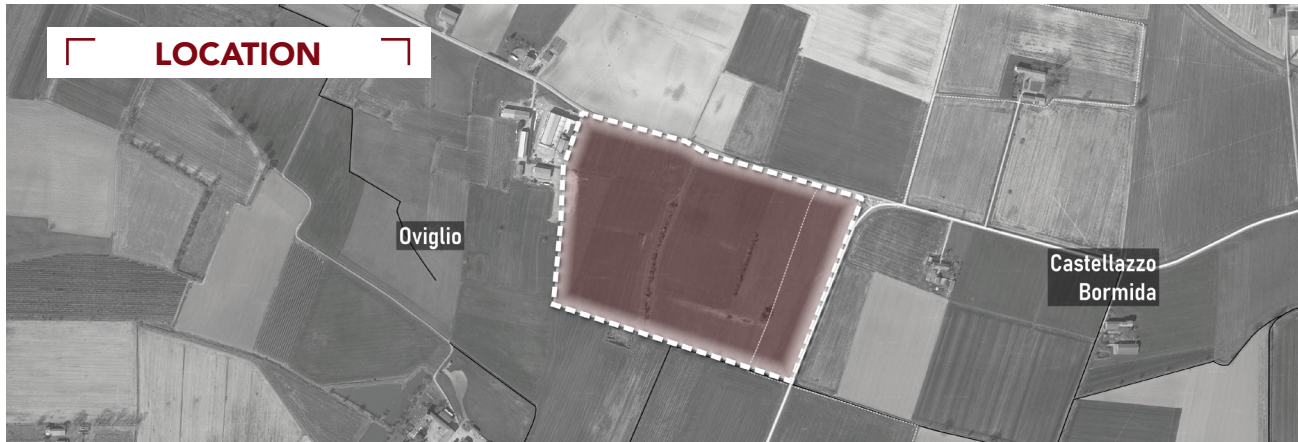
Oviglio (Alessandria), SP 245 (greenfield)

The area in question is located on the intersection of SP 245 and SP 240 and falls partly in the municipality of Oviglio (for 153.000 sqm) and partly in the municipality of Castellazzo B.da (for approx. 34,000 sqm). The site is about 7 km from the Alessandria Sud exit of the Torino Piacenza highway that can be reached in 8 minutes by Provincial Road 30. The catchment area at 60 min. (estimated within a basin calculated with heavy traffic) is 1.5 mln inhabitants.