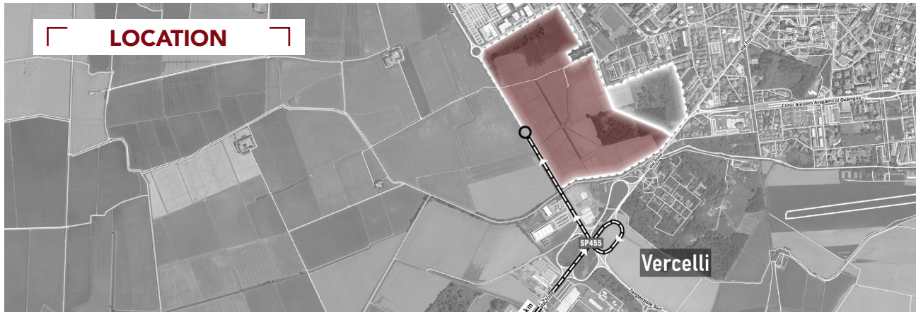
Vercelli (VC), Tangenziale Ovest, Area "Fabbriche Concordia"(greenfield)

457.000 sqm area located near Vercelli Ovest Ring Road, 2,2 km from the Vercelli Ovest motorway exit, which can be reached in 4 minutes. The area is part of a Town planning implementation plan that involves the creation of 132.000 sqm of covered surface destined to logistic it includes also 20.000 sqm for residential use. The 60 min catchment area is evaluated at 900.000 inhabitants (considering heavy transport).