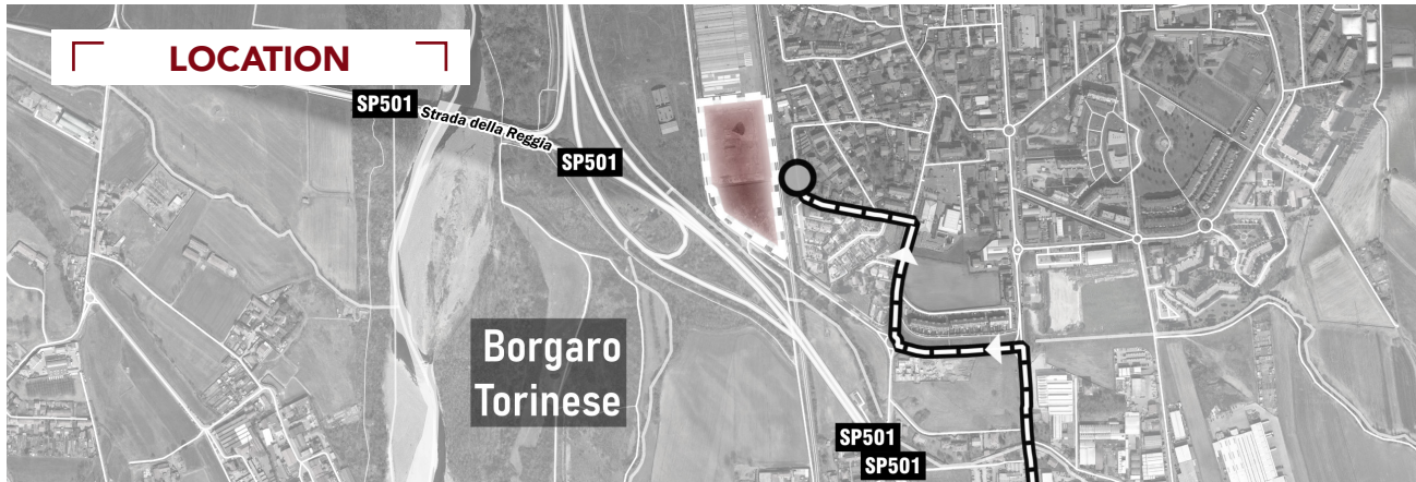
Borgaro Torinese (TO), Via Stati Uniti, Area "Ex La Siderurgica" (brownfield)

An area of approximately 22.700 square meters destined for productive/logistic use located close to route 501 which connects the north ring road of Turin (5 minutes/4km away). The catchment area 30 min away (assessed with heavy traffic) has 1.4 m inhabitants.