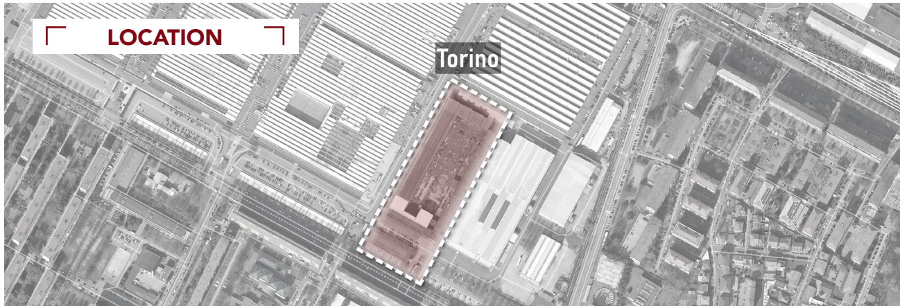
Torino (TO), Via Plava, Area "Ex Fiat" (brownfield)

The catchment area at 60 minutes (calculated with heavy traffic) gathers 2.3 mln people.